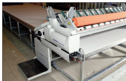
Optional platform allows operator to ride alongside the table