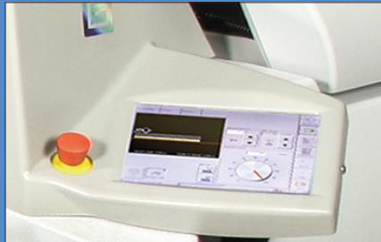
Intuitive graphical touch-screen simplifies operator training and use

Get exceptional quality and performance in a tension-free spreading system at an affordable price.