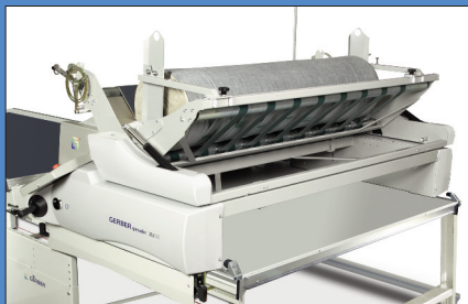
Cradle feed system provides tension-free spreading