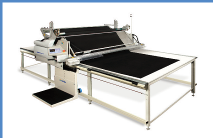
Available for left- or right-hand operation.