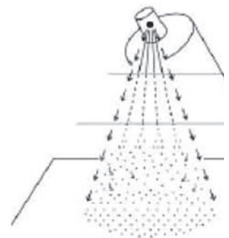
Fig. 3. Ideal spraying distance, lower pressure gives perfect mix of constituents